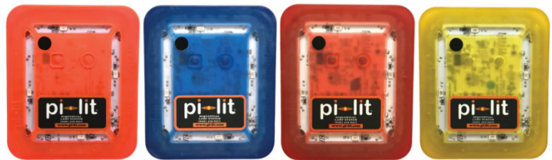
Available Colors: Orange, Blue, Red, Amber- Yellow (custom colors upon request)

Small and rugged, perfect for police, fire, first responders, maintenance crews, DOT safety workers, etc. ICS™ sequential flare is designed to replace traditional magnesium perchlorate flame flares. They are quick and easy to deploy and provide warning plus directional information not available with flame or other flares on the market. The new rechargeable system is even more environmentally friendly and offers economical savings when compared to incendiary flare.