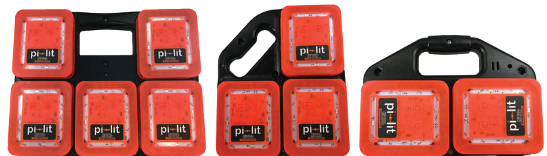
Sold in sets of 10, 6 or 4-flares